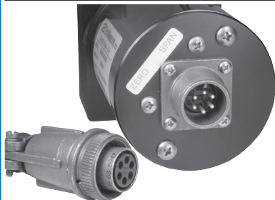
Connector with Mating Connector