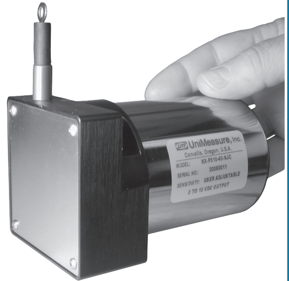
HX Series Ranges to 80" (2 m)