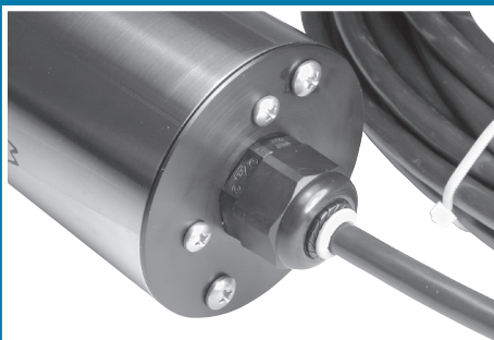
Bulkhead Fitting & Electrical Cable IP-68 (NEMA 6)