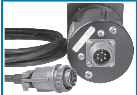
Connector w/ Mating Connector & Electrical Cable