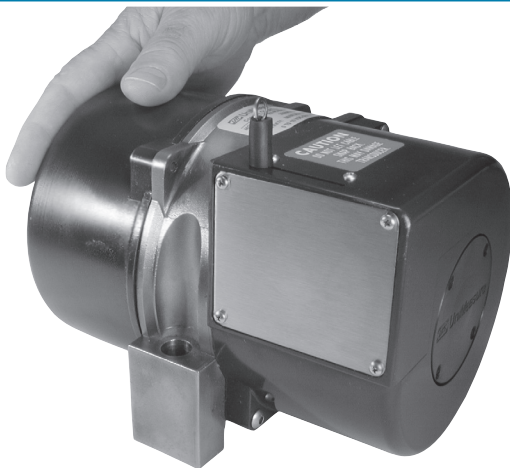
HX Series Ranges to 800" (20 m)